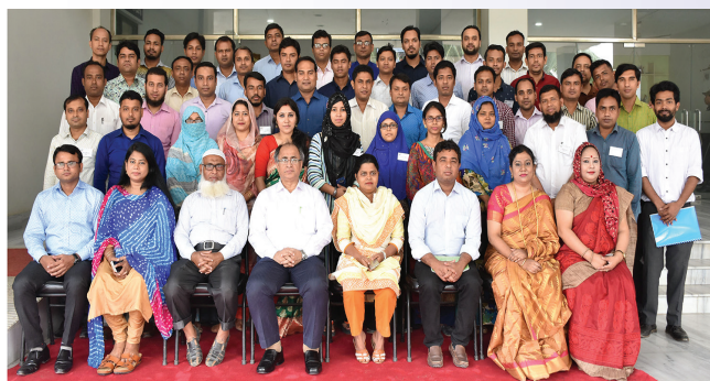
Participants from the 134th SAS/SRAS Part-I course with DG FIMA

From January to June, 2019, FIMA organized one SAS/SRAS Part-1 training course held from 23-01-2019 to 07-04-2019 and three SAS/SRAS Part-2 courses held from 23-01-2019 to 07-04-2019 & 23-04-2019 to 08-07-2019 where a total of 191 Auditors and Junior Auditors participated. Apart from taking preparation for SAS/SRAS exams, participants gain first-hand knowledge about the various functions of the Department and the Government in general.