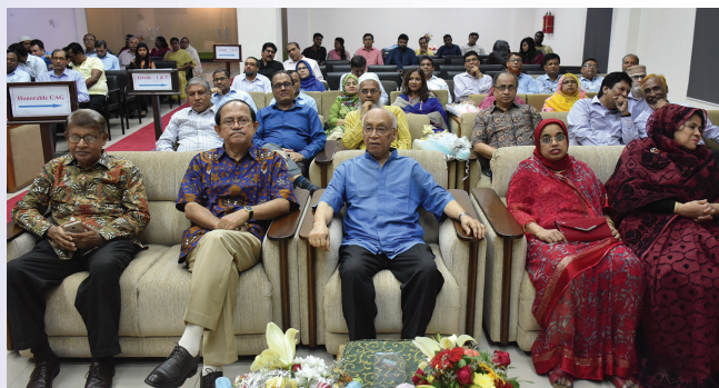
Mess Night at FIMA Campus on 25th June, 2019 hosted by AAG (Probationers), 36th Batch

25th June, 2019. FIMA wore a celebratory look from the evening. High officials including the honorable Comptroller & Auditor General and former DG's of FIMA attended the festivity. The cultural program was teemed with songs, poems & short play which the guest spoke highly of. A dinner was hosted after the end of the cultural program.