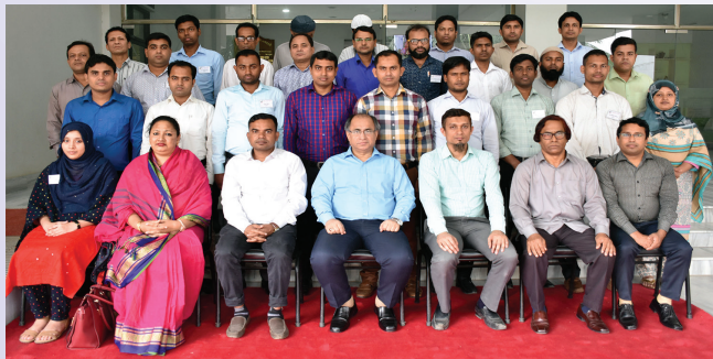
Participants of Training on Revenue Audit with Director General

Two Revenue Audit training for OCAG officials from 03-07 February, 2019 and 07-11 April, 2019 respectively were conducted by FIMA. A total of 57 officers participated in the training course.