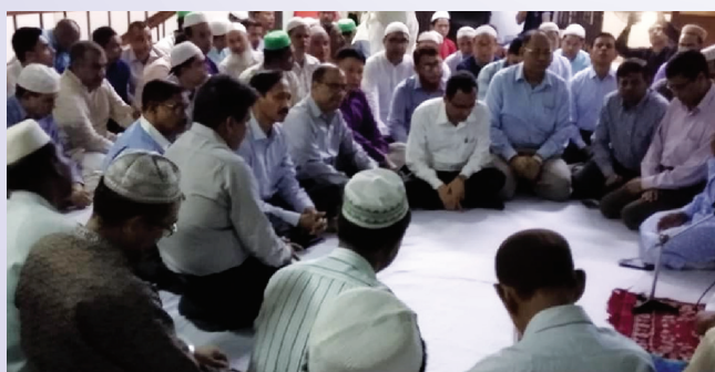
Attendees of Annual Milad Mahfil in FAPAD