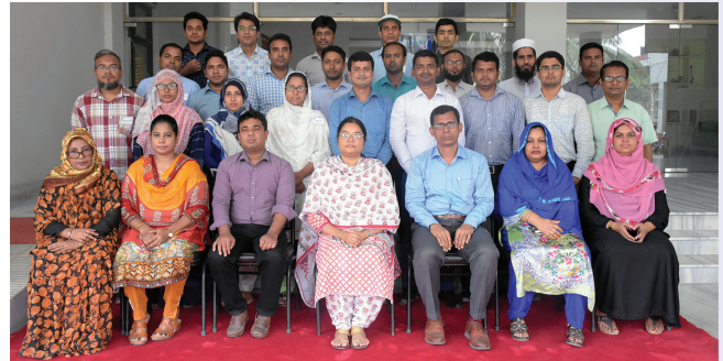
Participants of PPR-2008 Course with Director (Training)

Apart from organizing this regular course. FIMA also provided Public Procurement Training to 35 officials from Ministry of Planning from 23 December, 2018 - 08 January 2019.