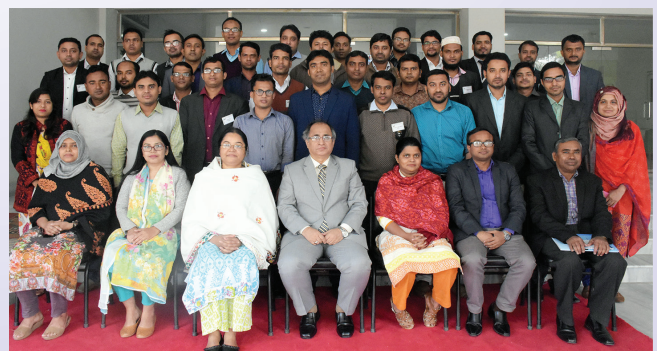
Participants of Auditor Orientation Course with Director General

FIMA organizes Auditor Orientation training course for the newly appointed Auditors on a regular basis. 372 Auditors from twelve different batches participated in this training from the month of January to June 2019.