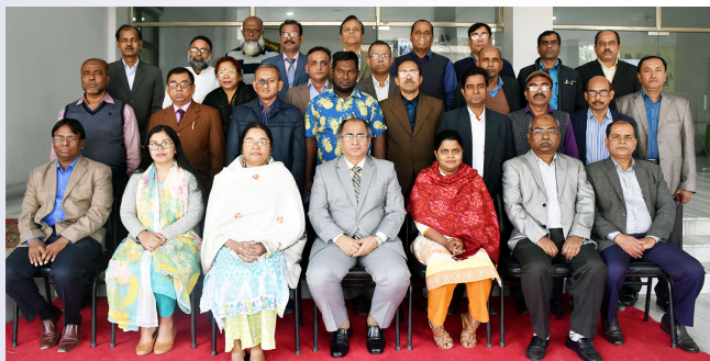
Participants of PFM Course for Divisional Accountants with Director General

A PFM Course for Divisional Accountants from 13-24 January 2019 was organized by FIMA. A total of 24 trainees participated in this course.