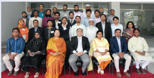
Participants of ISSAI Compliant Compliance Audit Course with Director General

FIMA organized one ISSAI Compliant Compliance Audit Course 10-14 February, 2019 which was participated by a total of 25 officers from Audit & Accounts Department.