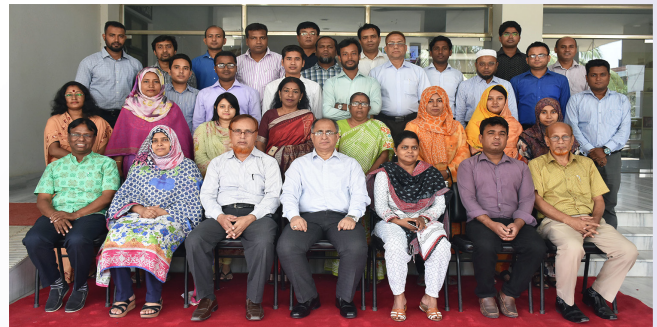
Participants of Environment Audit Course with Director General, FIMA

A 5 day-long Environment Audit Training Course from 12-16 May, 2019 was organized by FIMA. A total number of 32 officers from Audit and Accounts Departments participated in this training programme. FIMA believes this training program will help the government in its battle to tackle environmental hazards looming in Bangladesh.