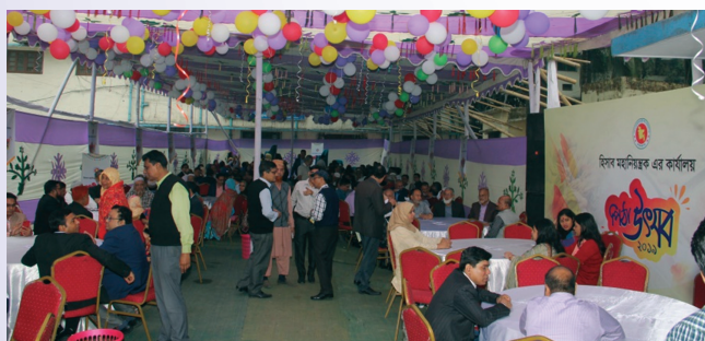
The officers and staffs of CGA office and Chief Accounts Offices at Pitha Utshab.