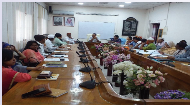
Participants of the workshop on “Audit Directives circulated by CAG Office and experience sharing”

A three day long workshop on “Audit Directives circulated by CAG Office and experience sharing regarding Appropriation Audit” from 09.06.2019 to 11.06.2019 was organized by PTST Audit Directorate. Audit directives circulated from 01.01.2018 till date from CAG office and the field audit experiences while conducting the newly introduced Appropriation Audit were presented and discussed in this workshop. Objectives of this workshop was to share knowledge and to develop skills.