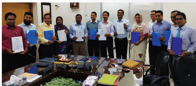
Annual Performance Agreements (2019-20) between Controller General of Accounts (CGA) and Chief Accounts Officers (CAO)/Divisional Controller of Accounts (DCA) were Signed on 20 June, 2019 at CGA office.

Earlier, the Annual Performance Agreements (2019-20) were signed with the Chief Accounts Officers and the Divisional Controllers of Accounts in a Signing Ceremony at the office of CGA on 20 June, 2019. A total of 50 Chief Accounts Officers and 7 Divisional Controllers of Accounts signed their APA of 2019-20 financial year. Accordingly, the APA (2019-20) of field level offices including District Accounts Offices and Upazilla Accounts Offices were also signed on the same day.