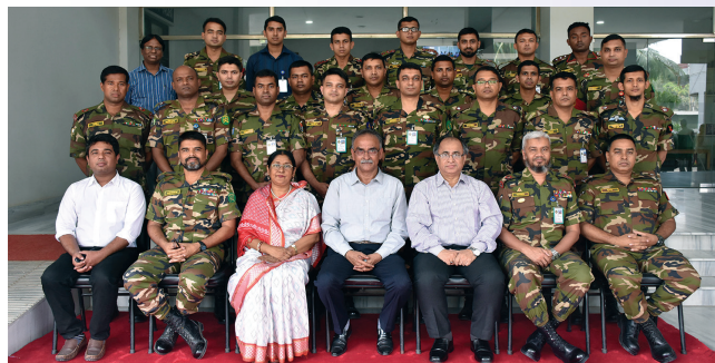
Participants of Public Financial Management Course for the Officers of Bangladesh Army (Batch-9) with Honorable CAG