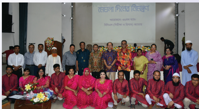
Mess Night at FIMA Campus on 25th June, 2019 hosted by AAG (Probationers), 36th Batch

AAG (Probationers), participants of the ongoing Departmental Training for AAG (Probationers) 36th Batch, hosted a Mess Night at FIMA Campus on