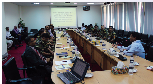
Participants of Public Financial Management Course for Officers of Bangladesh Army (Batch-6)

Participants of “Public Financial Management Course for Officers of Bangladesh Army (Batch-6)” had an attachment program on 16 March 2019 at CGDF office which was arranged by FIMA. Sixteen commissioned officers were participated in this half day long attachment training program. During this training, participants were taught about financial advisory function of CGDF and overall activities of CGDF. This attachment training was very much interactive and participatory.