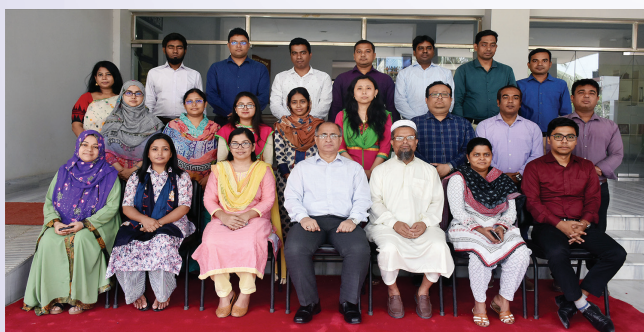
Participants of Mission Audit Training Course with Director General

Two Mission Audit Training Courses under the name of 'Mission Audit Training Course: Biman Bangladesh Airlines' and 'Mission Audit training Course (Bank Branches/Exchange Houses Abroad of State Owned Bank)' were organized by FIMA for OCAG officials from 12-15, 19 May, 2019 and 26 - 30 May, 2019 respectively. FIMA regularly organizes these training courses which enable the participants to have better understanding about the would-be findings during mission audit.