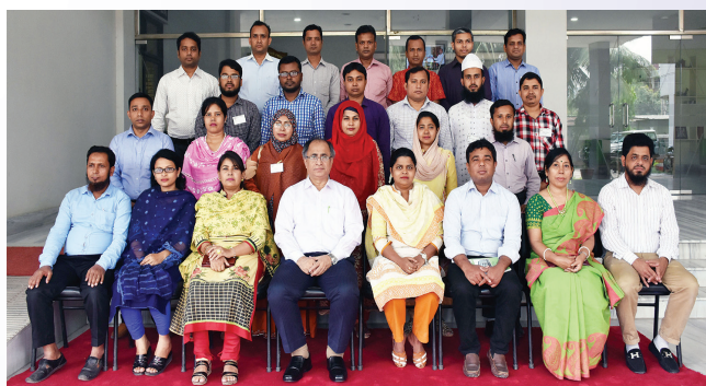
Participants from the 123rd SAS/SRAS Part-II course with DG FIMA